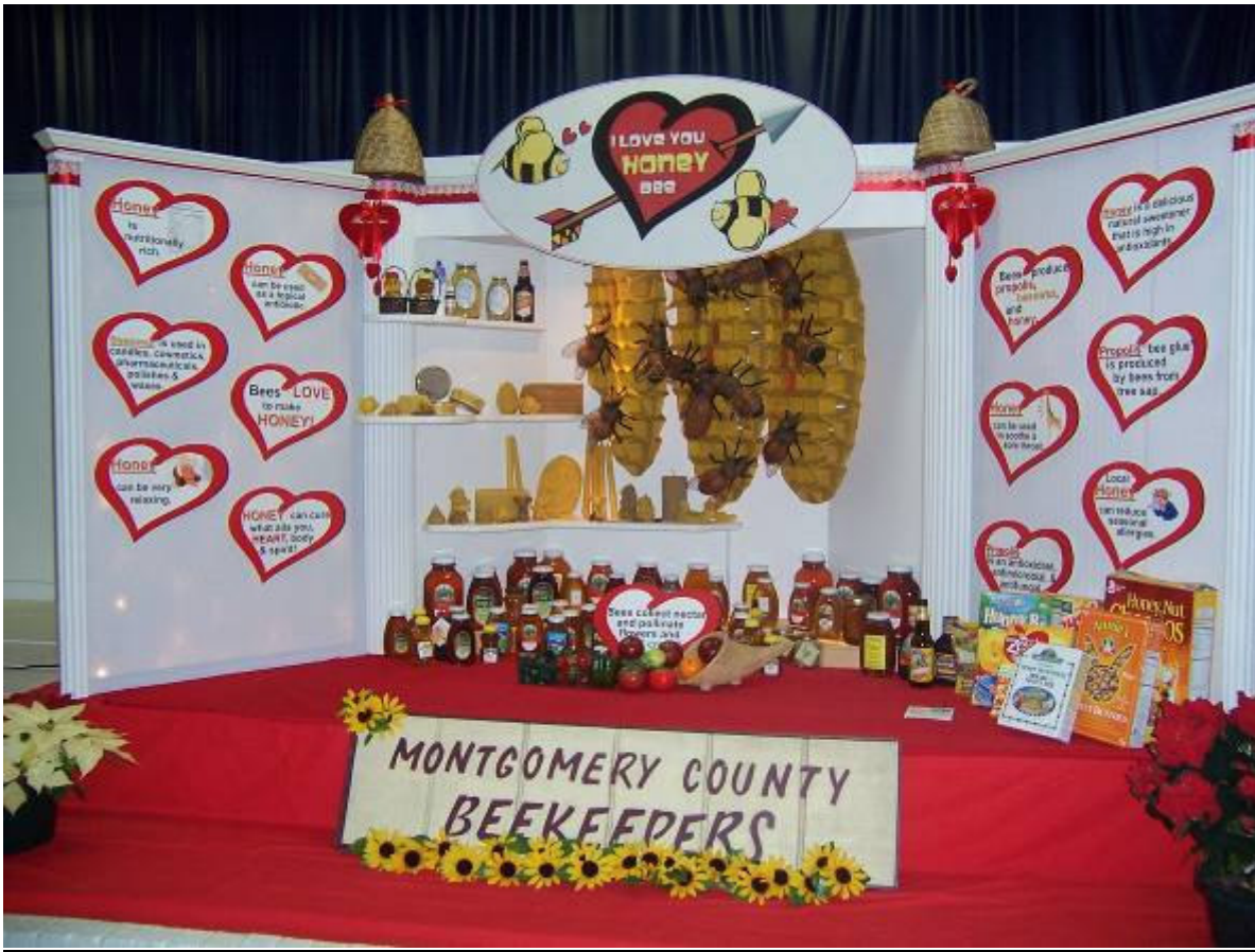
2008 MCBA Farm Show Display